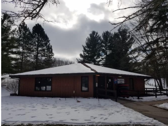
BURCHFIELD PARK (WINTER SPORTS BUILDING)