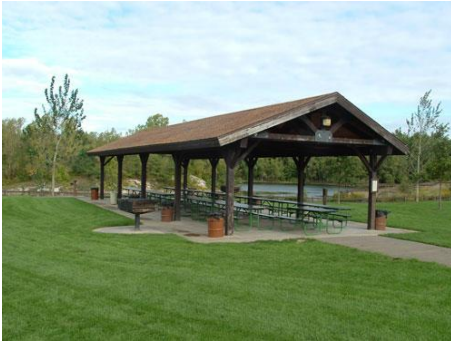
HAWK ISLAND PARK (KESTREL PICNIC SHELTER)